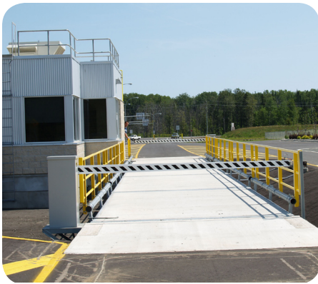
Pay on exit at the Weigh Scale Kiosk.

For more information, contact the City of Thunder Bay Transportation & Works Dispatch at 684-2195.