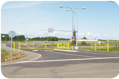
New entrance on Mapleward Road.