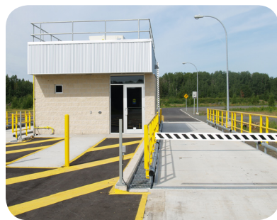
Weigh Scale Kiosk