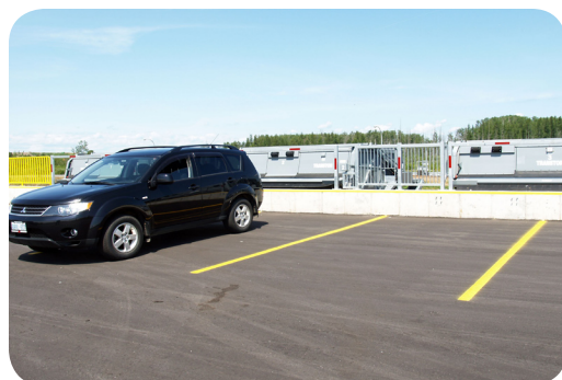
Deposit items into designated bins in the Public Waste Disposal Area.